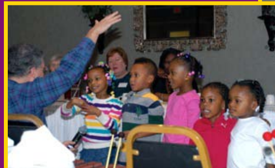
Children singing at Donors' Dinner.