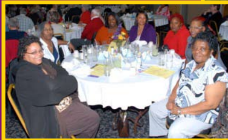
Staff is honored at dinner.