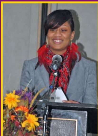
Former student shares memories.