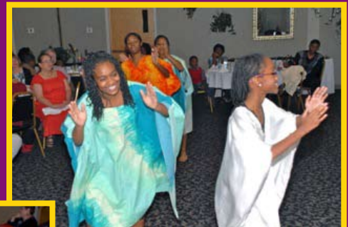
Dance and Drumming group performance.

Our first donor Thank-You Dinner was held on October 28, 2011 at The Shrine of Our Lady of the Snows in Belleville. The pictures, in this newsletter, are better than any words to describe what a wonderful event it was! So many friends of Kindercottage attended and heard about the difference their gifts are making in the lives of the young children and families of East St. Louis. We thank all of you who attended! We are looking forward to doing it again next year!